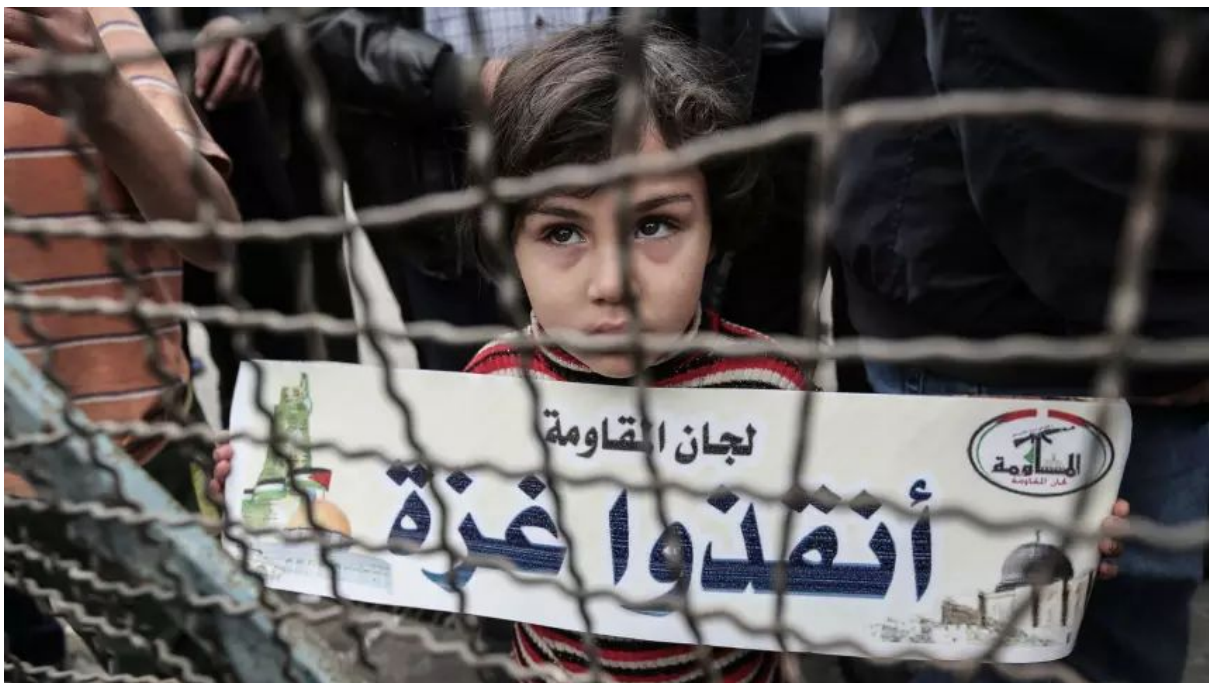
Palestinians take part in a protest against the US move to freeze funding for the UN agency for Palestinian refugees (UNRWA) at the Rafah refugee camp in the southern Gaza Strip on February 6, 2018.