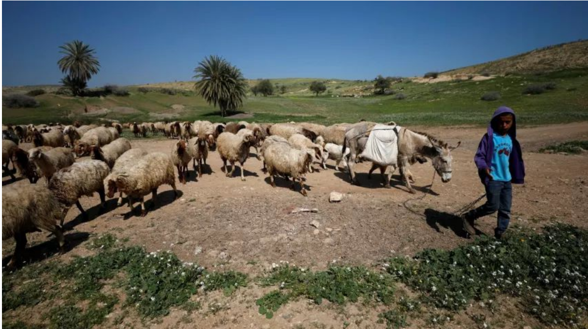
A Palestinian boy herds sheep in Jordan Valley in the occupied West Bank March 13, 2018. Picture taken March 13, 2018