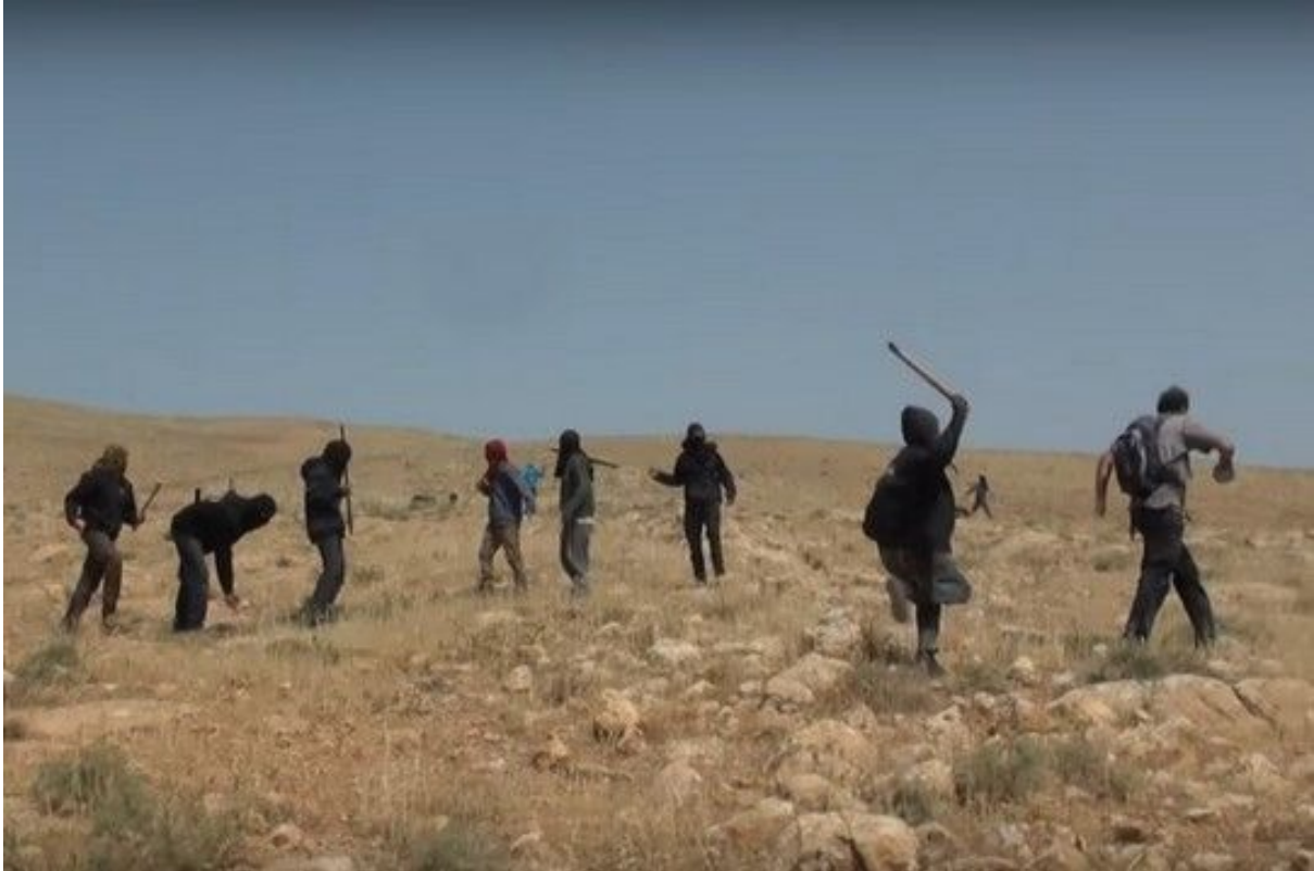
"We were severely attacked, but after that the army was forced to intervene." The Ball Gang in action

days, they confiscated my phone, even though all the calls to the 100 police headquarters are already recorded. " The phone, by the way, was not returned to him so far.