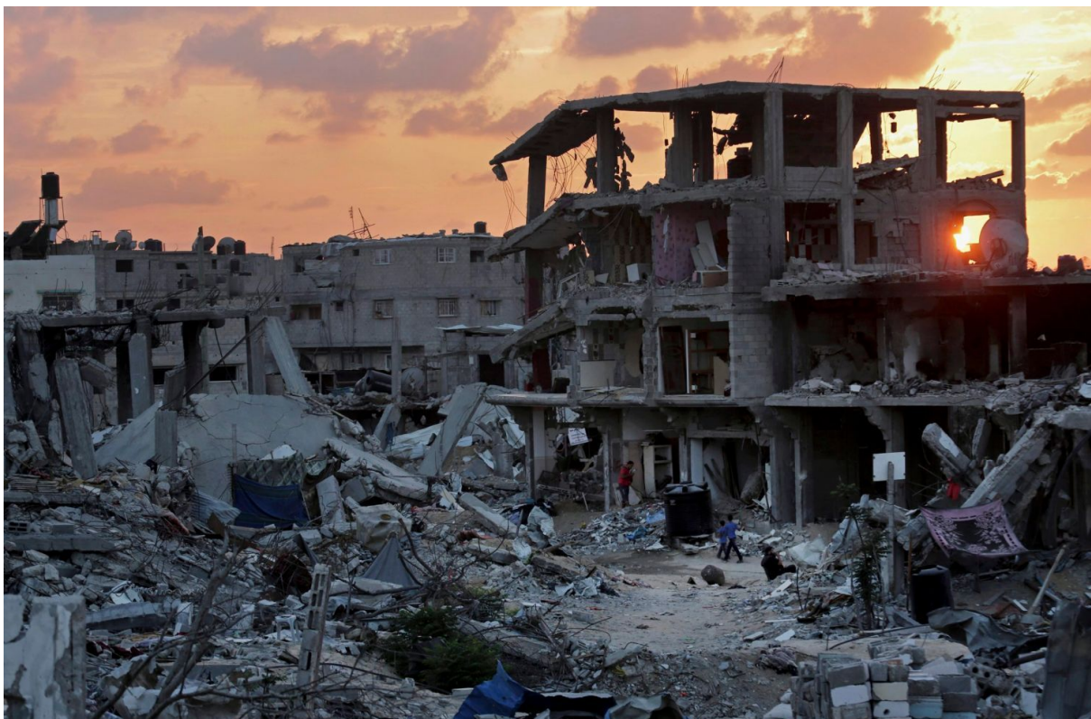
Palestinians walk during the sunset between the rubble of their destroyed building in Shijaiyah neighborhood of Gaza City in the northern Gaza Strip, Sunday, Oct. 12, 2014.

International aid to help rehabilitate the coastal enclave following the last war that Hamas and its allies fought with Israel in 2014 declined in 2017. That immediately affected construction activity in the strip and resulted in a decline in the number of those employed and drawing salaries.