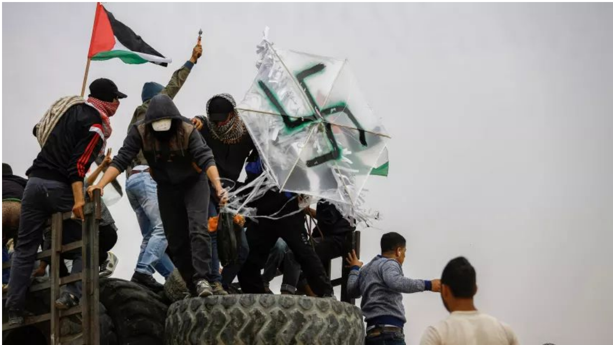
Gaza protesters hold a kite with a swastika painted on it, April 2018.